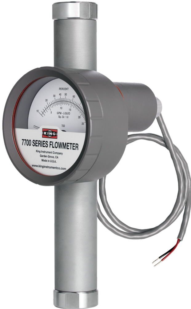
7710 with 4-20 mA Transmitter

4-20 mA Transmitter for 7710, 7720, 7750